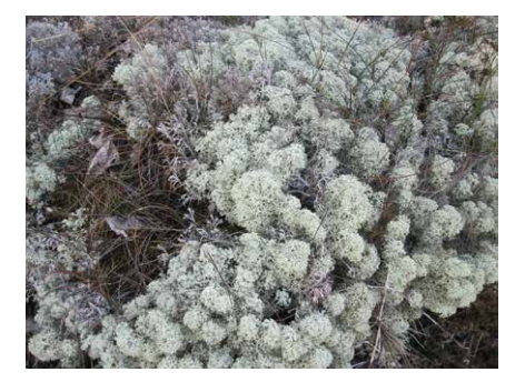
Cladonia stellaris and C. rangiferina ground cover on Valisaari island.