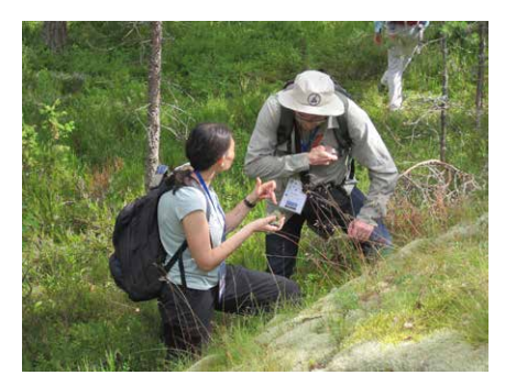
Discussing identifications during the excursion on Valisaari island.