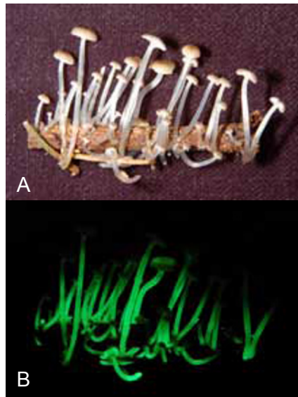
Mycena luxaeterna . A. In daylight. B. Luminescent in the dark. Photo: © Cassius V Stevani.

Psathyrella aquatica , referred to as the