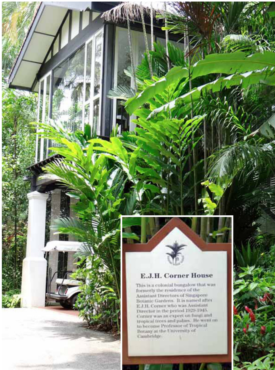
Corner's house in the Singapore Botanical Gardens, March 2013.

fitting that he was one of the two recipients of the first de Bary Medal of the IMA in 1996. Yet it often comes as a surprise to aspiring mycologists when they discover that he also monographed figs, produced standard works on palms and Malaysian trees, two volumes of drawings of the seeds of tropical plant, and had a novel theory on how fruits of flowering plants evolved – the Durian Theory of 1949 that spawned often emotive arguments amongst traditional botanists. In 1967 he stated that “we must turn to the facts of nature and rediscover the truth”. Yet information on many aspects of the life of this remarkable and endlessly inquisitive and independent scientist have remained something of mystery and speculation.