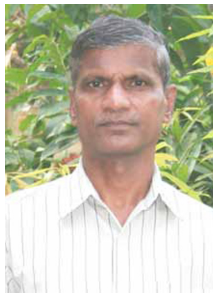
V. B. Hosagoudar.

Hosagoudar VB (2013) My contribution to the fungal knowledge of India. Journal of Threatened Taxa 5: 4129–4348.