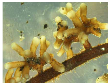
Tuber indicum forming an ectomycorrhiza with Pinus armandii .

Averill C, Turner BL, Finzi AC (2014) Mycorrhiza-mediated competition between plants and decomposers drives soil carbon storage. Nature 505: 543–545.