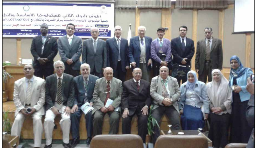
Some participants in the 2<sup>nd</sup> International Conference on Basic and Applied Mycology, Assiut, Egypt, 14–15 March 2015.

Amongst the topics addressed were: Challenges confronting Mycology,