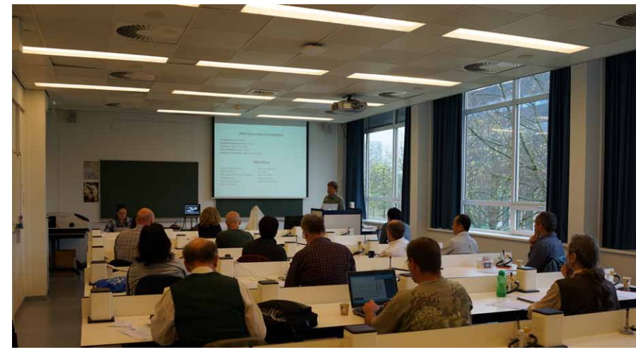
The IMA Executive Committee in session at CBS.

<sup>1</sup>This has since happened. <sup>2</sup>See pp. (3)–(5) in this issue.