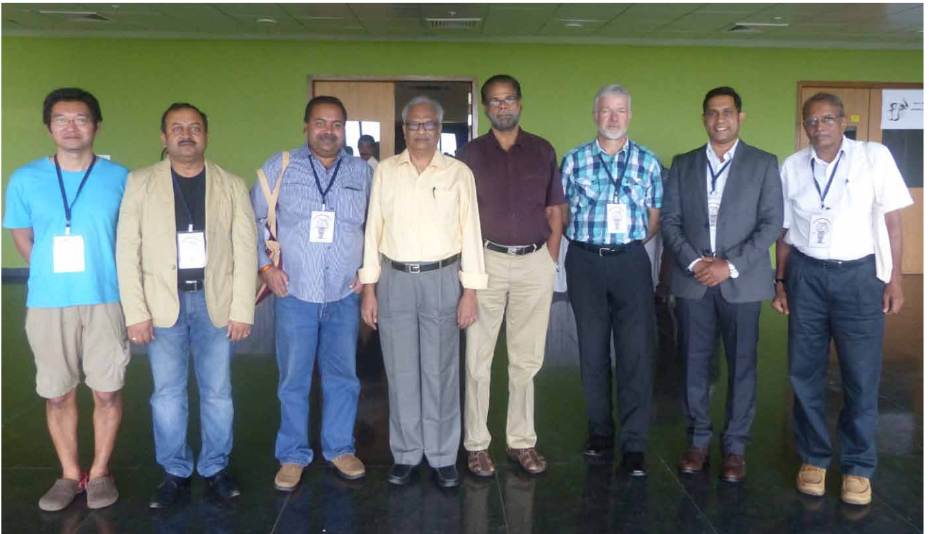
Participants at the Fungal Conservations symposium held during the Asian Mycological Congress in Goa.