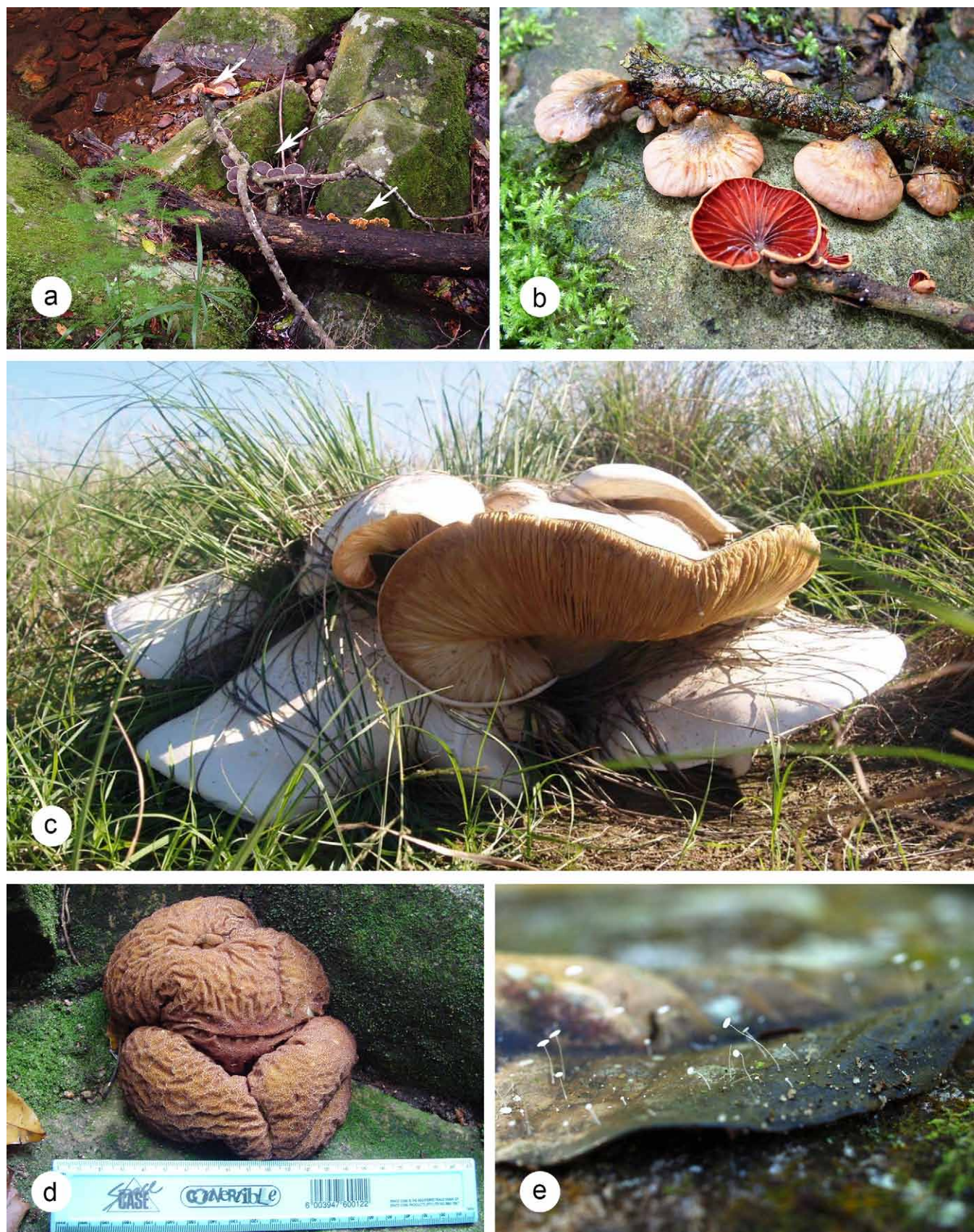
Fig. 1. Various types of larger fungi. (a) Three types of bracket fungi commonly found in forests; white arrow, the tropical cinnabar bracket ( Pycnoporus sanguineus ); grey arrow, the black cork polypore ( Trametes cingulata ); dotted arrow, the false turkey tail ( Stereum ostrea ). (b) Anthracophyllum archeri , a bracket fungus from Mpumalanga identified from an Australian field guide. (c) The gigantic Macrocybe lobayensis first discovered by a field guide user in the iSimangaliso Wetland Park, but remained unknown until the identity was obtained from an Australian mycologist. (d) An unknown fungus, still unidentified. (e) Minute basidiomes of a possible Mycena sp. on a rotting leaf.