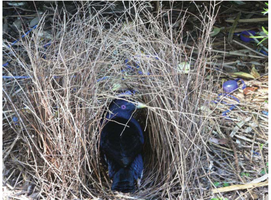
Bird in bower.

Perhaps there are other cases as well in which particular bowerbirds have