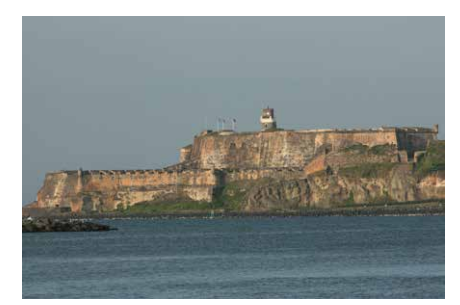
Fig. 5. El Morro, the biggest Spanish fortress in the Caribbean, in Old San Juan, Puerto Rico.