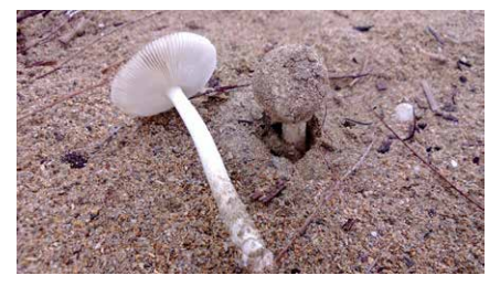
Fig. 12. The beach-loving ringless Amanita arenicola , one of the few species of Amanita known from Puerto Rico.

species. Some families of basidiomycetes that are restricted to wet forests, such as Hygrophoraceae and Entolomataceae , have higher rates of unique (endemic) species (60-75 %). This makes the island of Puerto Rico a unique mycological paradise.