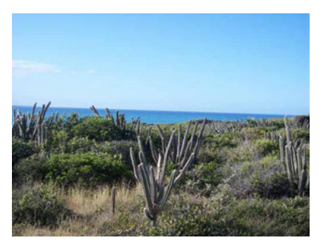
Fig. 4. Guánica Dry Forest in the south coast of Puerto Rico.