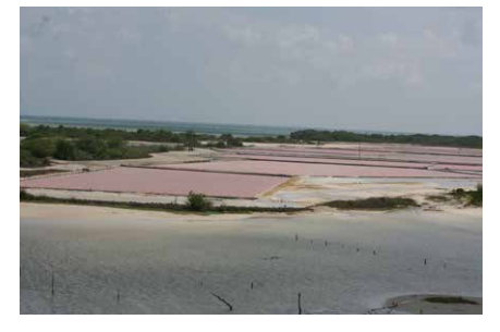
Fig. 1. Cabo Rojo salterns and salt flats in the southwest coast of Puerto Rico.

Puerto Rico is home of several natural and technological wonders. Deep in the north limestone region, the Arecibo Radio Telescope (ART; Fig. 2) was built between 1960–63. The Arecibo Ionospheric Observatory is open under the supervision of William E. Gordon who manages the world's largest single-dish radio telescope. The Observatory is recognized as one of