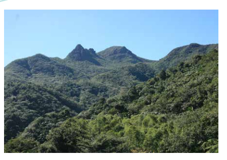
Fig. 3. El Yunque National Forest in the north east of Puerto Rico.