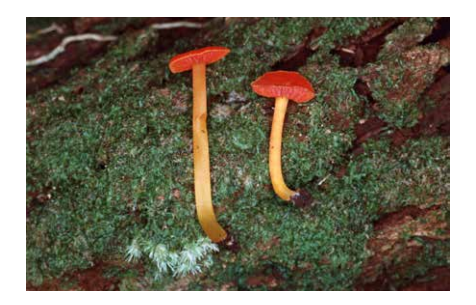
Fig. 9. Hygrocybe miniatofirma , an endemic cloud forest species only known from two locations in El Yunque National Forest. This species has been recently added to the Red List of Fungi.