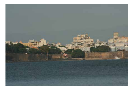
Fig. 6. The wall city of Old San Juan. At the center in dark red the only standing gate can be seen and the blue building at the right is La Fortaleza, the home of the Governor of Puerto Rico.

Visitor Center you can see the publications and the Nobel Prize.