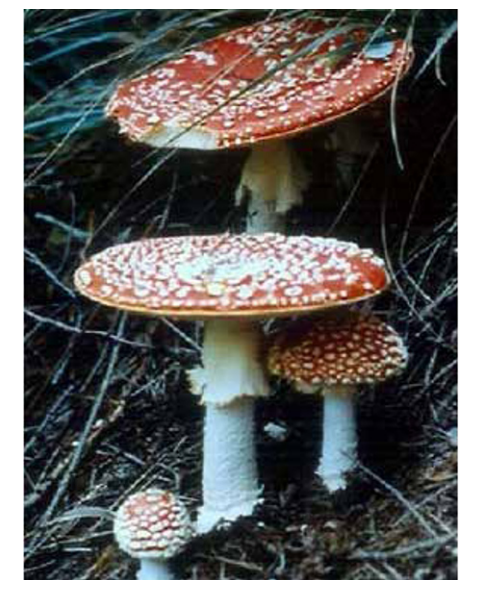
Amanita muscaria.

schizohymenial ontogeny (Tulloss et al. 2016). They argue that the split degrades an ability to communicate and complicates links with the past literature, and further that the ecological differences related to the presence or absence of cellulases are not as clear-cut as suggested by Redhead et al. (2016).