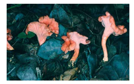
Fig. 10. Cantharellus coccolobae , the only species of this genus found in association with different species of Coccoloba in Puerto Rico. This particular photo is from the Guánica Dry Forest after all the rain that Hurricane Georges left in the island.

be discovered. Of the 3,315 known fungal species in Puerto Rico, 24 % are endemic to the island. It is estimated that between 15-20 % of the fungi collected in a single field trip might represent new records or