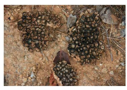
Fig. 11 . Diplocystis wrightii , an inconspicuous puffball found buried in the soil in the Guánica Dry Forest.

be discovered. Of the 3,315 known fungal species in Puerto Rico, 24 % are endemic to the island. It is estimated that between 15-20 % of the fungi collected in a single field trip might represent new records or