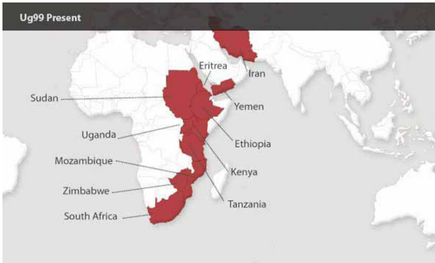
World distribution of Puccinia graminis race Ug99 on wheat (November 2011).