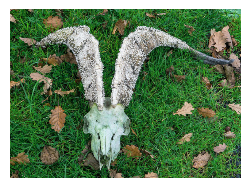
Fig. 5. Onygena species. Non-pathogenic species of Onygenales, are specialized in breaking down the keratin found in feather, hooves, and horn. The keratin is composed of proteins, bound in a non-bio-accessible form. Among the large number of different proteases produced by O. corvina , we discovered that just three enzymes, belonging to two types of protease families, are sufficient to breakdown both feather and pig bristles. The picture shows O.equina growing on horn, but not on the skull (Northern Ireland, 2012).

gained right now from chytrids and zygomycetes, notably Entomophthorales (Grell et al. 2011) and Mucorales (Huang et al. 2014).