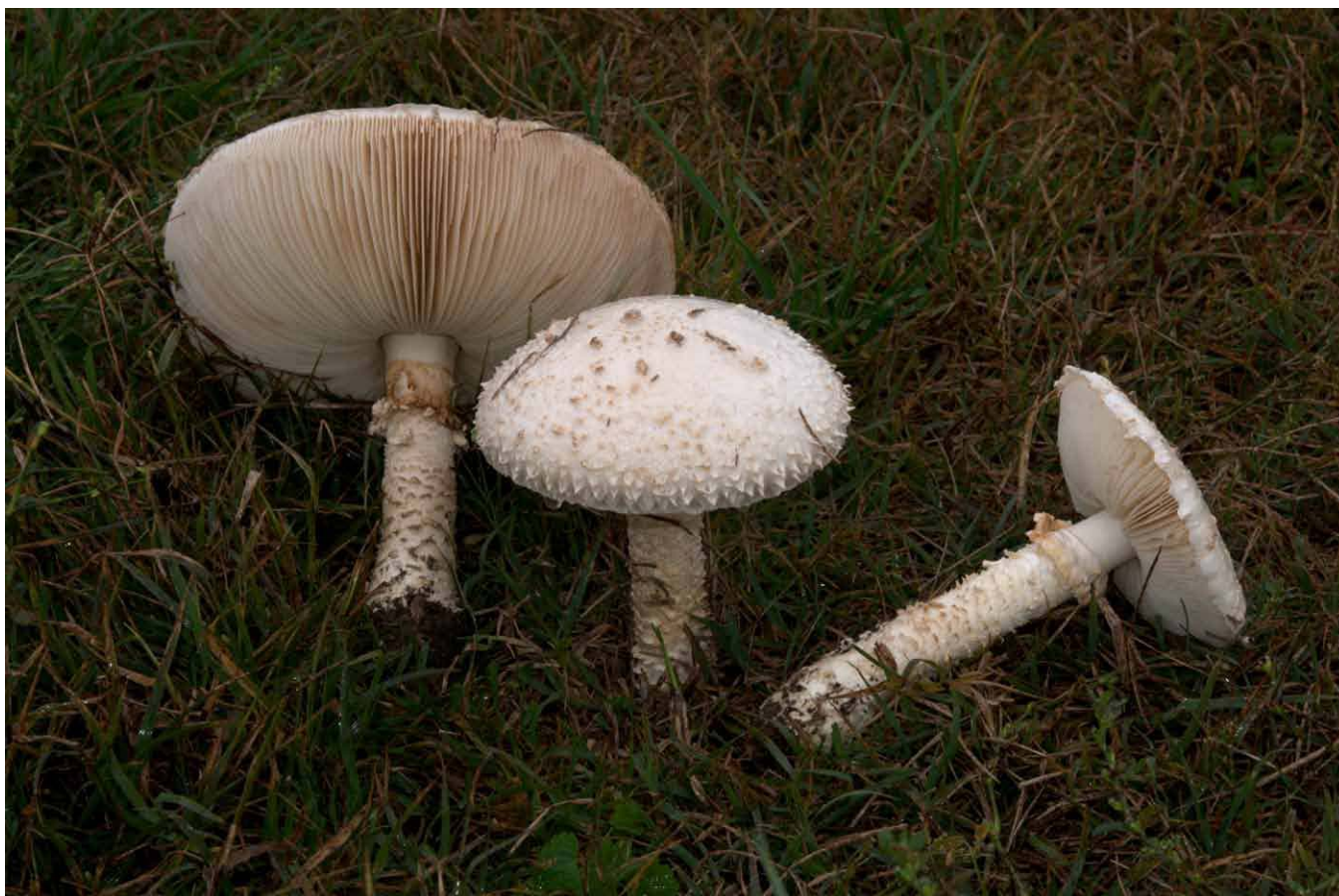
Fig. 2. Saproamanita vittadinii . Photographed in situ in Italy by Francesco Dovana.

(3) the quartet signature pagination counts [multiples of 4, i.e. 20, 12, and 12 pages] together with type setting of paragraphs on pages differing from the 'Giornale' and beginning each page one; (4) the different bimestri distribution of the issues of the 'Giornale'; and (5) finally the difference in appearances of the first two plates from the third plate which presumably was subject to different handling or storage conditions (cf. Biodiversity Heritage Library scanned copy from the Arnold Arboretum, Harvard University). These facts and evidence indicate that the Tab. 1 depicting Agaricus vittadinii published in the 'Botanico Italiano' is original material, just as is the case for Potentilla grammopetala depicted on Tab. 2 because they were simultaneously published and distributed together with the 'Giornale'. Therefore, the lectotypification by Bas (1969) of Agaricus vittadinii by Tab. 1 (Moretti 1826b) that Bas designated sight unseen, can be accepted. Bas (1969) had seen Vittadini's (1826) reproduction and accepted Gilbert's (1941) indication that it is the same illustration published by Moretti. We can confirm that the illustrations are identical. This illustration representing the lectotype is republished here as our (Fig. 1) comparable to the species in the field (Fig. 2).