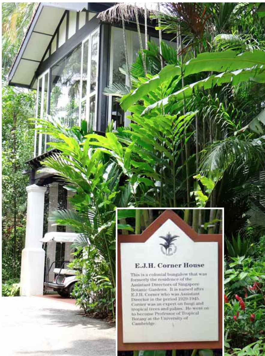
Corner's house in the Singapore Botanical Gardens, March 2013.

fitting that he was one of the two recipients of the first de Bary Medal of the IMA in 1996. Yet it often comes as a surprise to aspiring mycologists when they discover that he also monographed figs, produced standard works on palms and Malaysian trees, two volumes of drawings of the seeds of tropical plant, and had a novel theory on how fruits of flowering plants evolved – the Durian Theory of 1949 that spawned often emotive arguments amongst traditional botanists. In 1967 he stated that “we must turn to the facts of nature and rediscover the truth”. Yet information on many aspects of the life of this remarkable and endlessly inquisitive and independent scientist have remained something of mystery and speculation.