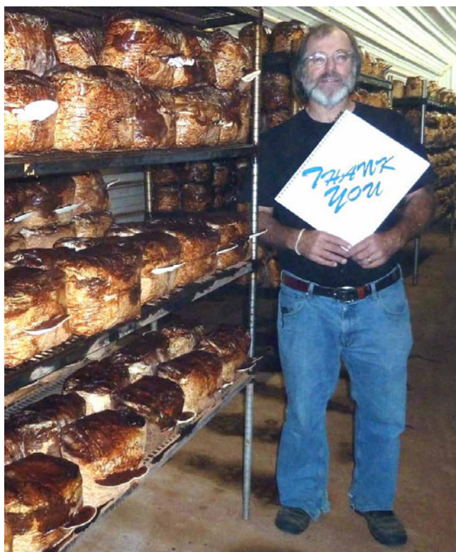
Paul Stamets in his "reishi" ( Ganoderma ) cultivation room.

This new award of the Mycological Society of America (MSA) recognizes people with non-traditional academic backgrounds who have made outstanding contributions to