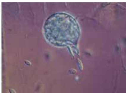
Phytophthora mycoparasitica . Zoosporangium releasing zoospores.