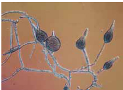
Phytophthora epistomium , zoosporangia.